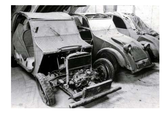
Recently Discovered Prototype 2CVs (Not the ones we're driving)

We are raising funds for the Thames Valley & Chiltern Air Ambulance Trust so sponsorship of the "Snails" is required. Sign writing and logos will be arranged by the organisers.